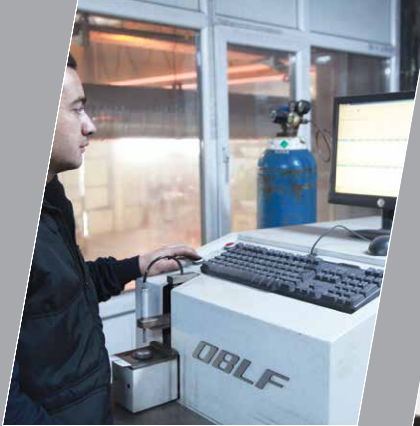
OBLF model 18 element spectrometer