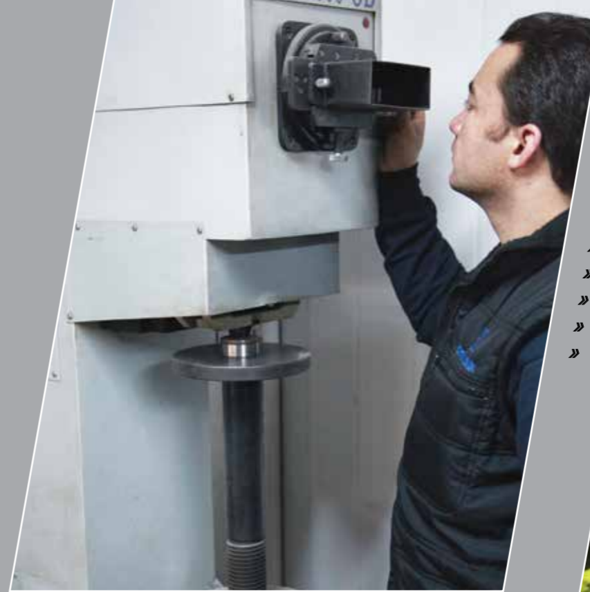
Hardness Measurement Device