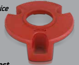
Magnetic particle test